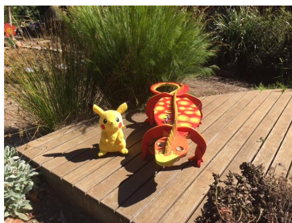
Pikachu, on his way home with some souvenirs.