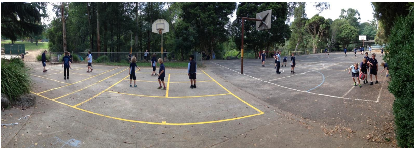
Anastasia and Jade build a nest of leaves! Natasha, Tameem and Kiana feed our new chickens at lunch. Grade 5 & 6 students play basketball.